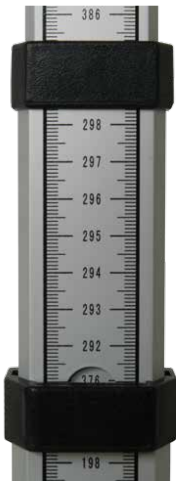
Height scale in mm on back of rod